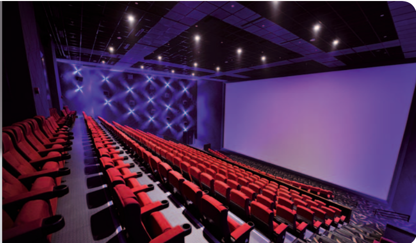
Barco Auro 11.1 audio system at Wangfujing Cineplex, China